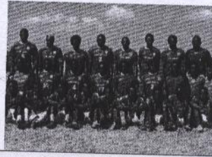
GOR GO FOR THE JUGULAR AFTER GREAT 2010 SEASON Profile of Gor Mahia FC, last season's Kenyan Premier League Runners up. P.17, 26 & 27