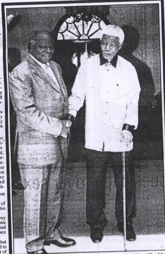
President Mwai Kibaki with former South African President Nelson Mandela who paid him a courtesy call at State House, Nairobi, yesterday.