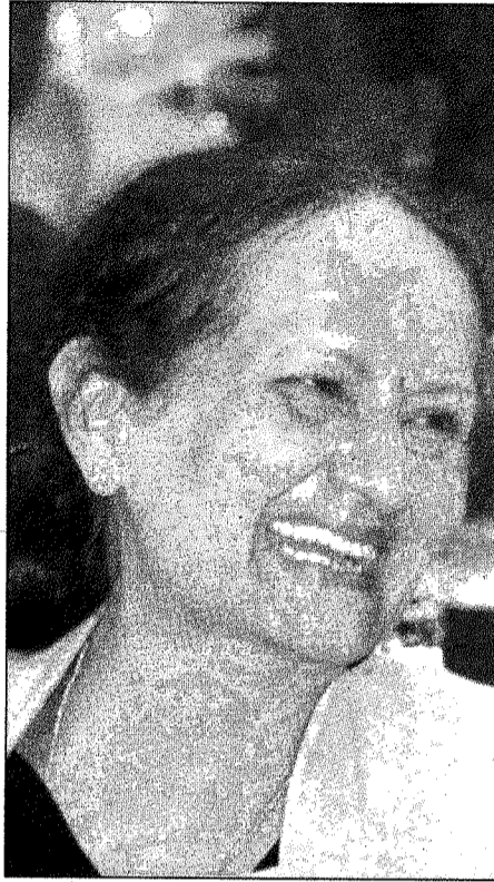
UNBOWED: Deputy Chief Justice Kalpana Rawal on August 3.

But the JSC argued there are no constitutional questions to warrant a bench because the dispute is between an employer and an employee.